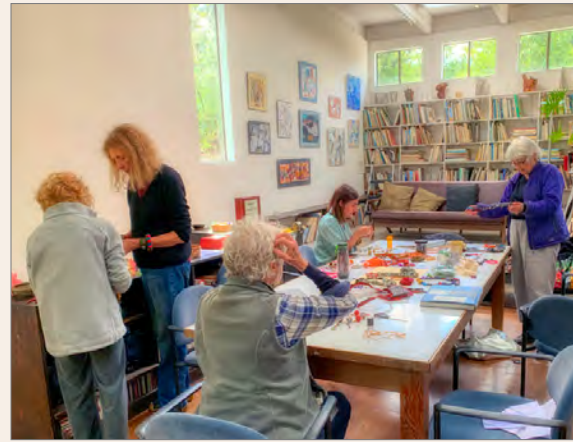
ART IN THE AFTERNOON