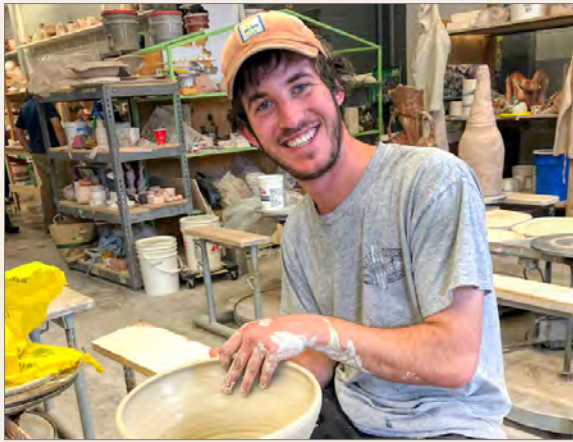
ADULT 3-DAY CERAMIC CAMP