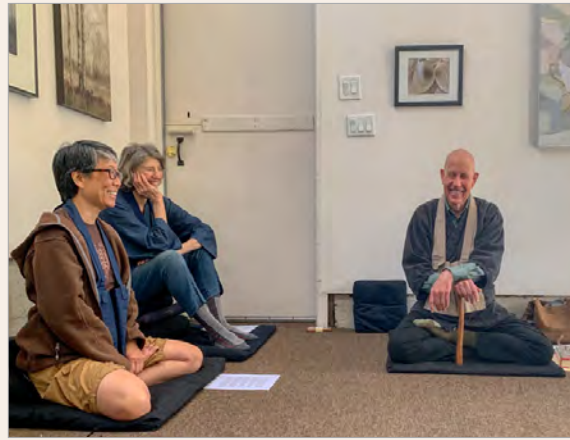
VIMALA SANGHA MEDITATION