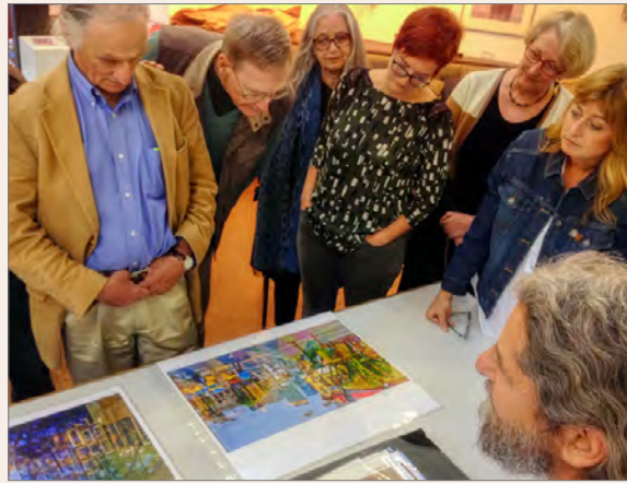
OHCA PHOTO GROUP